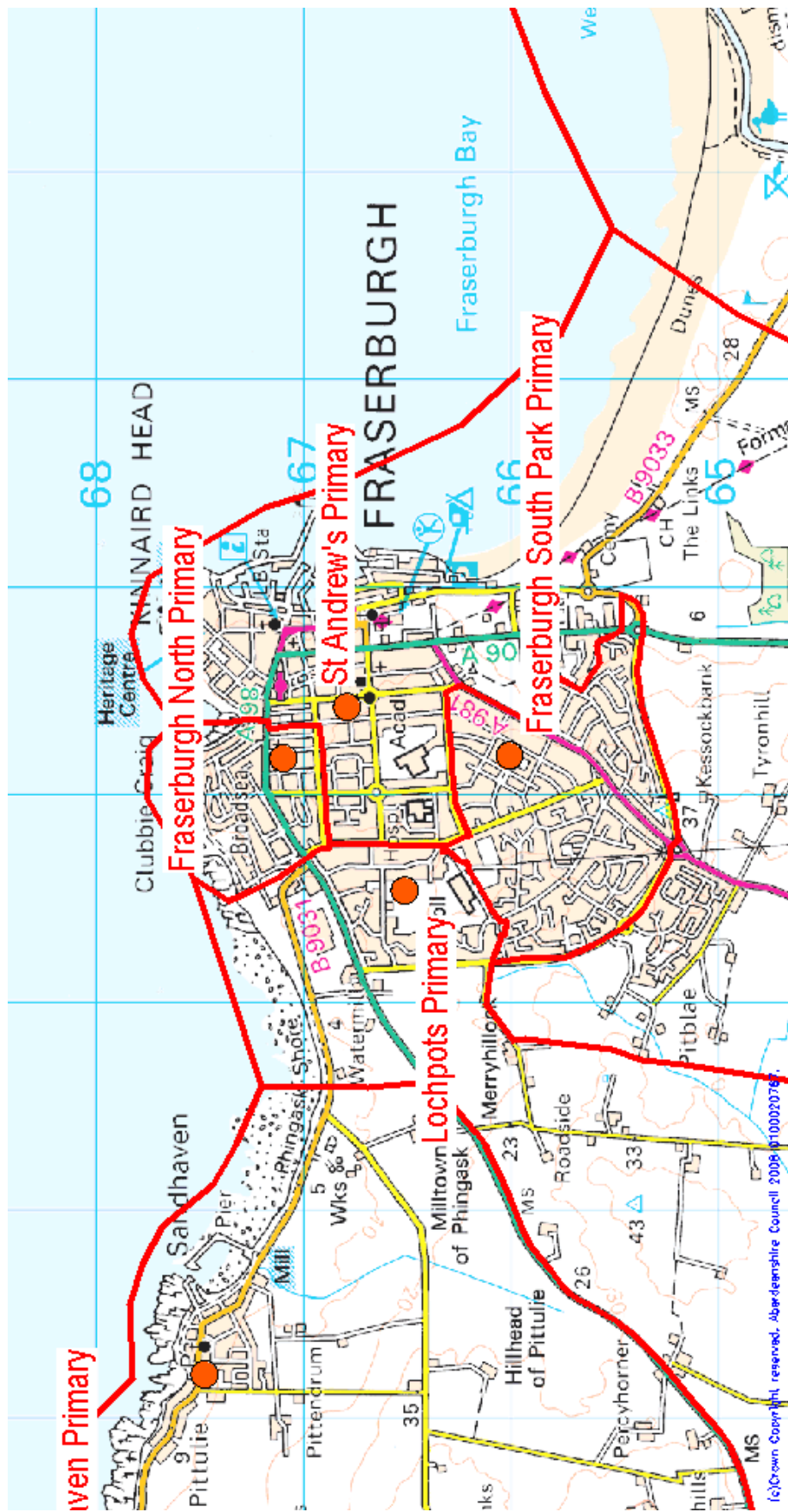
Map of Catchment Area